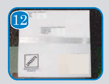
Send shipment via FedEx (or equivalent) to: Centers for Disease Control and Prevention CDC Warehouse

3719 N. Peachtree Rd. Chamblee, GA 30341 ATTN: Chariety Sapp - (770) 488-0343