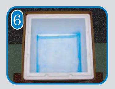
Use polystyrene foam-insulated, corrugated fiberboard shipper to ship boxes to CDC. Place absorbent material in the bottom of the shipper.