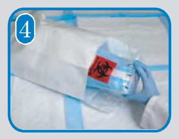
Place the sealed Saf-T-Pak inner leakproof polybag (or equivalent) inside a white Tyvek ® outer envelope (or equivalent). Note: If primary receptacles do not meet the internal pressure requirement of 95 kPa, use compliant secondary packaging materials.