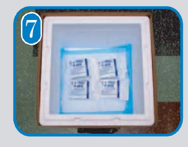
Place refrigerator packs in a single layer on top of the absorbent material.