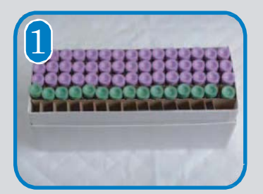
Place purple- and gray- or green- top tubes by patient number into a gridded box lined with an absorbent pad.

For detailed instructions see CDC's Shipping Instructions for Specimens Collected from People Who May Have Been Exposed to Chemical Agents.