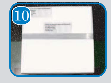
Secure the shipper lid with filamentous shipping tape. Place your return address in the upper left-hand corner of the shipper top and put the CDC Laboratory receiving address in the center.