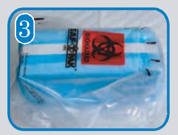
Wrap gridded box in absorbent pad and tape to seal. Seal gridded box inside a Saf-T-Pak clear inner, leak-proof polybag (or equivalent).