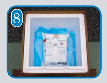
Place the packaged specimens in the shipper. Use cushioning material to minimize shifting while box is in transit. Place additional refrigerator packs on top of samples.