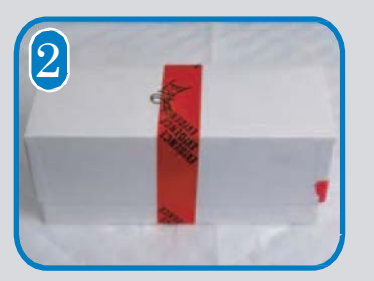
Seal gridded box with one continuous piece of evidence tape. The individual making the seal must initial half on the tape and half on the packaging.