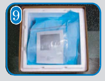
Place the blood shipping manifest in a sealable plastic bag and put on top of the sample boxes inside the shipper. Keep your chain-of-custody documents for your files. Place lid on the shipper.