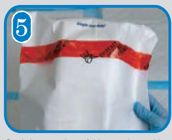
Seal the opening of this envelope with a continuous piece of evidence tape. Write initials half on the evidence tape and half on the envelope.